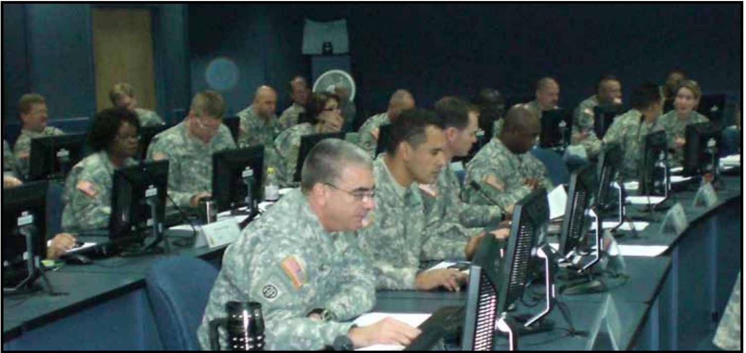
Senior warrant officers attending their Professional Military Education course at the Warrant Officer Career College.